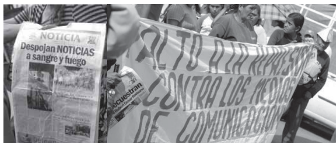
Demonstrator in the streets of Oaxaca protesting against the violent occupation of Noticias Newspaper.